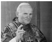
Karol Wojtyla 1920-2005 Pope Saint John Paul II