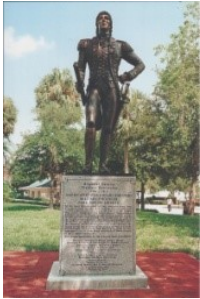
Tadeusz Kosciuszko 1746-1817 Military Leader